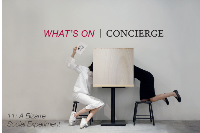
11: A Bizarre Social Experiment

The Singapore Art Week and activities to kick off the Singapore Bicentennial celebrations take centre stage this month